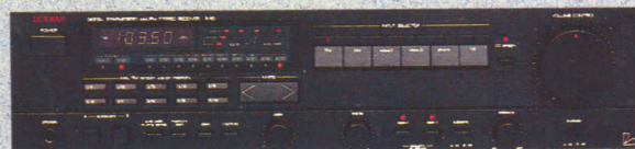
R-113 AM/FM Stereo Receiver (35 Watts/Ch.)

The R-114 is Luxman's newest receiver. This model offers Luxman performance, with all of the circuit designs found in the R-115. The R-114 is ideal when used in systems where a limited amount of power is needed and remote control is desired. For the future, Main-in, Pre-outs are also included to allow the addition of larger power amplifiers if needed. Multi-room remote control, record out selectors and tape dubbing are available for improved system flexibility. Includes remote control. (17-1/4"W x 4-3/4"H x 14-3/4"D; 17.2 Lbs)