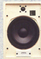
S-503 Wall Mount Loudspeakers w/hidden sensor eye (6½" Woofer)