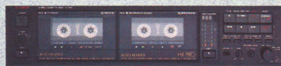
K-110W "Dual Well" Auto-Reverse Cassette Deck (HX-PRO)

In the tradition of Luxman "Ultimate Fidelity" components, all cassette recorders incorporate sophisticated technologies like Duo-Beta, STAR Circuitry, Hexalam Heads and HX-PRO for optimum sonic accuracy. Each model is designed for a specific application.