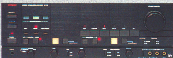
LV-117 Stereo Integrated Amplifier (110 Watts/Ch.)

(17-1/4"W x 5-13/16"H x 13-7/8"D; 25.3 Lbs)