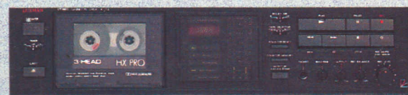
K-112 3 Head, Double Dolby Cassette Deck (HX-PRO)