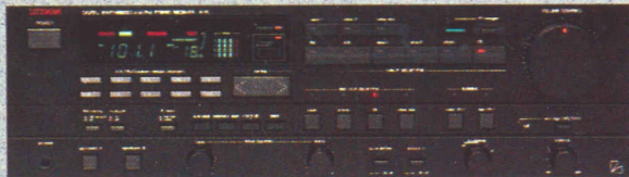
R-117 AM/FM Stereo Receiver (160 Watts/Ch.)

The R-117 is Luxman's most powerful receiver, combining a high-current high-speed power amplifier with a dual-gate MOSFET FM design. In addition, STAR circuit topology, Voltage Driven Amplification and Duo-Beta circuitry are included to achieve a level of sonic performance previously found in more expensive separate components. A variety of features such as full remote control are included for convenient operation and versatility in many different applications. (17-1/4"W x 5-1/2"H x 16-11/16"D; 35.2 Lbs)