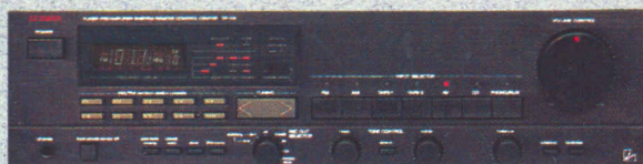
TP-114 Multi-"Room" Remote Tuner/Preamp