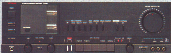
LV-105u "Brid" Stereo Integrated Amplifier (80 Watts/Ch.)

Luxman Integrated Amplifiers all employ voltage-driven amplification for optimum dynamic performance with negligible transient inter-modulation or slew induced distortion. In addition all use High Energy power supplies with high filter capacitance to provide the steady state and dynamic power necessary for proper reproduction of even the most demanding musical transients.