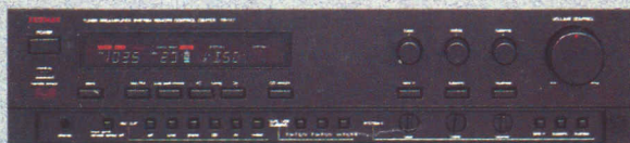
TP-117 Multi-"Zone" Remote Tuner/Preamp

For 65 years, Luxman "Separate" components have won numerous awards for their innovative circuit designs and sonic superiority. The latest generation of Luxman Separates further advance the "state-of-the-art" in terms of performance and flexibility.