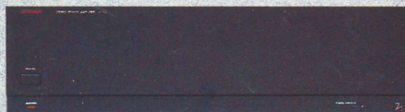
M-113 Voltage-Driven Power Amplifier (50 Watts/Ch.)

The TP-117 is a tuner/preamplifier in a class of its own. As a single, stand alone audio component the sonic quality rivals the finest tuners and preamplifiers in the world. As a master control center, it accommodates the most sophisticated audio/video applications. With two separate, high-quality preamplifiers combined into one chassis, the TP-117 allows multiple-room remote operation, independent from the main system. This unique design enables separate control over source, volume, and power in each connected zone with five external sensor inputs for "two-zone" operation in up to fifteen rooms. Two remote controls are included. (17-1/4"W x 4-3/8"H x 13"D; 11.4 Lbs)