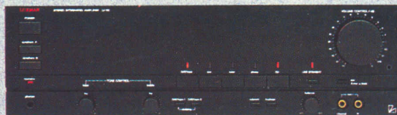
LV-112 Stereo Integrated Amplifier (55 Watts/Ch.)

The LV-112 presents such Luxman features as a subsonic filter to remove very low frequency components resulting from warped records, tone arm resonances or other causes, and "Line Straight" which bypasses tone and other controls for the shortest direct path to the power amplifier ensuring the best possible fidelity, imaging, and sonic impact.