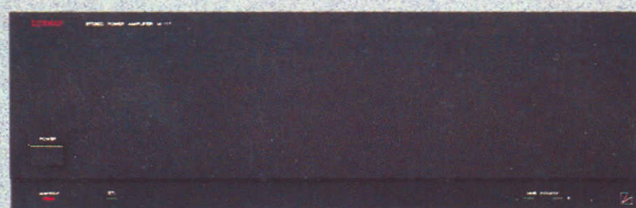
M-117 Voltage-Driven Power Amplifier (200 Watts/Ch.)