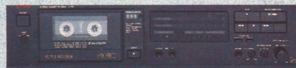
K-110 Auto-Rev., Bi-Directional Record Cassette (HX-PRO)