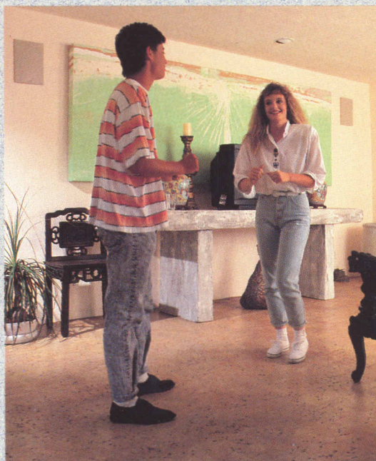
Each room in your home can connect to the main system with S-505 or S-503 speakers, eliminating the need for another audio system in that room.

The S-505 and S-503 loudspeakers bring true high fidelity sound to any wall or ceiling installation. Designed primarily for home entertainment rooms, S-505 and S-503 loudspeakers are also moisture resistant and work well in the higher humidity of a kitchen, bathroom... anywhere where in-wall speakers are desired. The speakers accommodate the RC-501 sensor eye for easy "hidden" installation and can be painted to match any environment.