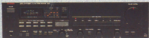
R-114 AM/FM Stereo Receiver (50 Watts/Ch.)

For the R-115 , Luxman has combined their design talents and manufacturing skills to achieve their goal — a receiver that sounds better. A simple goal, perhaps, but few manufacturers have attained it. Increased dynamic range and expanded headroom are among the more important factors contributing to the sonic superiority of the R-115. Includes remote control. (17-1/4"W x 5-1/2"H x 16-11/16"D; 25.5 Lbs)