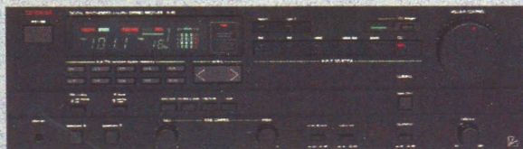
R-115 AM/FM Stereo Receiver (70 Watts/Ch.)

The R-117 is Luxman's most powerful receiver, combining a high-current high-speed power amplifier with a dual-gate MOSFET FM design. In addition, STAR circuit topology, Voltage Driven Amplification and Duo-Beta circuitry are included to achieve a level of sonic performance previously found in more expensive separate components. A variety of features such as full remote control are included for convenient operation and versatility in many different applications. (17-1/4"W x 5-1/2"H x 16-11/16"D; 35.2 Lbs)