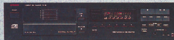
DC-113 6-Disc CD Changer (Single Play Capability)

The DC-114 achieves single play performance in a multi-disc format by utilizing sophisticated circuit designs such as Duo-Beta and Voltage Driven Amplification. In addition, the DC-114 "CD Shuttle" is the only changer compatible to the Alpine 5952 "CD Shuttle" for the car. A single "magazine", holding 6 discs can be played in either the 5952 or the DC-114 "CD Shuttle". Now moving your CD's from the car to your home (and back again) is simple! (17-1/4"W x 4-7/8"H x 13-1/2"D; 15.1 Lbs)