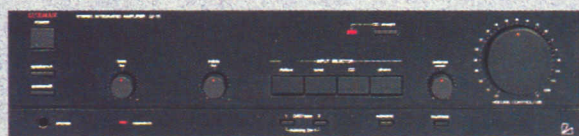
LV-111 Stereo Integrated Amplifier (40 Watts/Ch.)

(17-1/4"W x 5-3/8"H x 14-3/8"D; 19.8 Lbs)