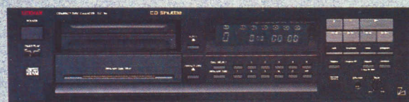
DC-114 6-Disc CD Changer (Single Play Capability)

By combining musicality with the convenience of a multi-disc format, the Luxman engineers have created two very special CD changers.