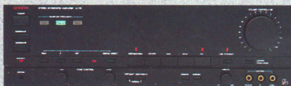
LV-113 Stereo Integrated Amplifier (65 Watts/Ch.)

(17-1/4"W x 6-1/2"H x 17-1/8"D; 34.5 Lbs)