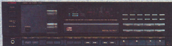
D-105u Compact Disc Player ("Brid" Tube Circuitry)