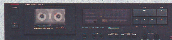
K-111 2 Head, Full Logic Cassette Deck (HX-PRO)

The K-110W offers the ultimate record/playback convenience while maintaining excellent sonic reproduction. This "double" auto-reverse transport allows high-speed duplication, simultaneous playback of two tapes, and dual deck programmability. (17-1/4"W x 4-5/16"H x 10-11/16"D; 10.6 Lbs)